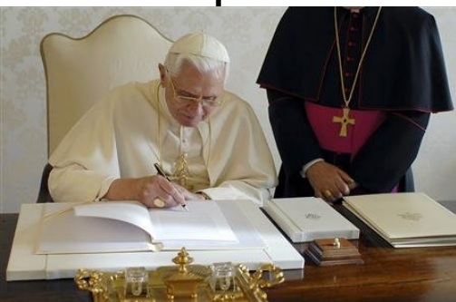
Ratzinger—a man of supreme ignorance

"Atheism was responsible for some of the greatest forms of cruelty and violations of justice in history."